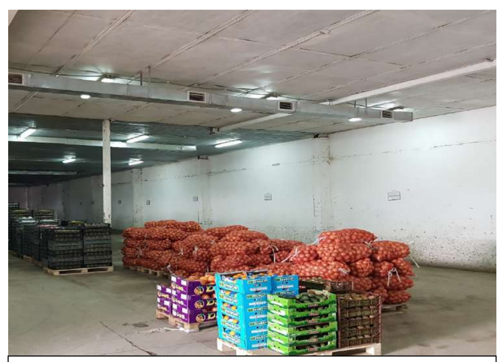
This cold storage in Rwanda is considered a "premium facility" used for storing produce for export. It is HACCP (Hazard Analysis Critical Control Point) certified and has passed international standards. Yet, inspection by experts found multiple types of produce that require different temperatures, along with debris on the floor and walls which allows bacterial growth and food contamination. This is in violation of the HACCP certification for safe food storage.

Creating an unbroken cold chain is expensive. Larger companies invest in this because they have the resources and the ROI is higher product quality and quantity, which garners higher prices in the marketplace. SMEs, especially in the informal sector (roadside kiosks, wet market stands, etc.), cannot compete at this level even though they know it will make their product safer.