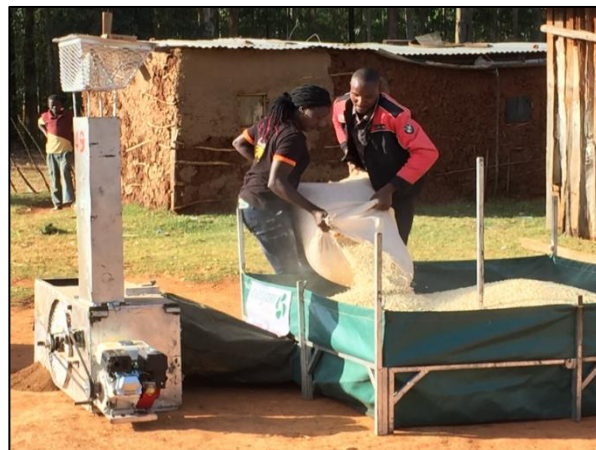
Photos, L to R: Service providers transport the EasyDry M500 to the next farm; The EasyDry M500 in operation

AflaSTOP developed the EasyDry M500 as an open source technology that can dry maize in batches of 500kgs, lowering the moisture level from 18 to 20% to approximately 13.5% in 3 hours, with the aim to dry three batches per day in one location. It has been piloted in Kenya, Tanzania and Rwanda to date. It is profiled on www.easydry.org .