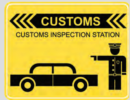
Simple pictorial instructions